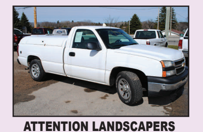
2006 Chevy Silverado with built in Spray Equipment. Topper, Leather, 4 new tires. $229 A MONTH OR LESS