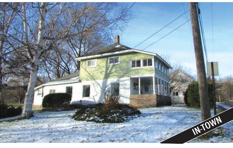
1009 WATER, EAST JORDAN • $79,900

Nice home on the edge of East Jordan, Two car detached garage, Paved drive, Large city lot with alot of room for the kids to play in the back yard, extra storage building in the back, Great views of the west side of East Jordan from the upper level enclosed Porch. Fresh shingles in the last Year. MLS 438945. Ask for Chris Oliver.