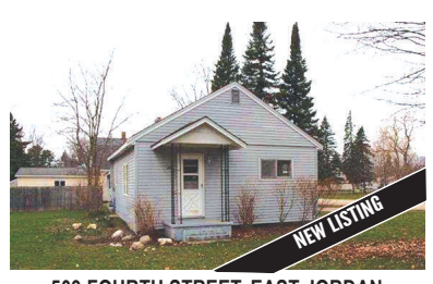
509 FOURTH STREET, EAST JORDAN Turnkey home, within walking distance to schools and down town. Newer roof, attached garage and quiet neighborhood. MLS 440288. Ask for Mike Stark. $59,900

109 Mill Street • East Jordan •231-536-7700