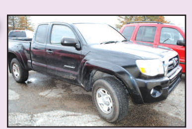
2007 TOYOTA TACOMA PreRunner SR5. V-6, tow pkg, extended cab, one owner. $225 A MONTH OR LESS

NICE, NICE, NICE! EACH PRICED AT JUST $15,995