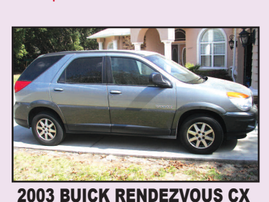
Nice looking SUV. SALE PRICE $5,995