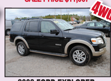
2008 FORD EXPLORER Eddie Bauer, tow pkg, 4x4, leather, power moonroof. $199 A MONTH OR LESS