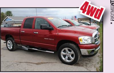
2007 DODGE RAM 1500 BigHorn edition. 4x4, ext cab, 4 door, seats 6, Reese tow pkg. SALE PRICE $12,995.