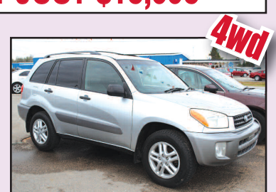
2002 TOYOTA RAV 4 4WD, nice! $199 A MONTH OR LESS