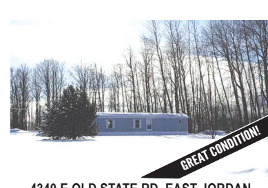
4340 E OLD STATE RD, EAST JORDAN This home sits on almost 2 acres close to the Jordan River and would make a great year round home or perfect get away..MLS 439354. Ask for Holly Nierman $49,900

Nice home on the edge of East Jordan, Two car detached garage, Paved drive, Large city lot with alot of room for the kids to play in the back yard, extra storage building in the back, Great views of the west side of East Jordan from the upper level enclosed Porch. Fresh shingles in the last Year. MLS 438945. Ask for Chris Oliver.