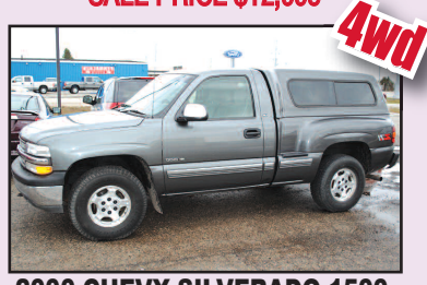
2000 CHEVY SILVERADO 1500 4x4, step side, Leer fiberglass topper, tow pkg. $199 A MONTH OR LESS