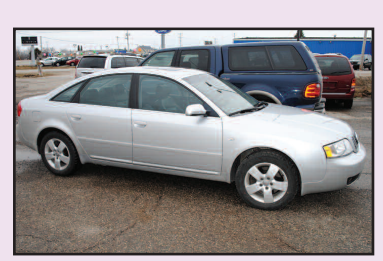
2003 AUDI A-6, 3.0 QUATTRO AWD, pwr. moonroof, dual climate control. SALE PRICE $7,995